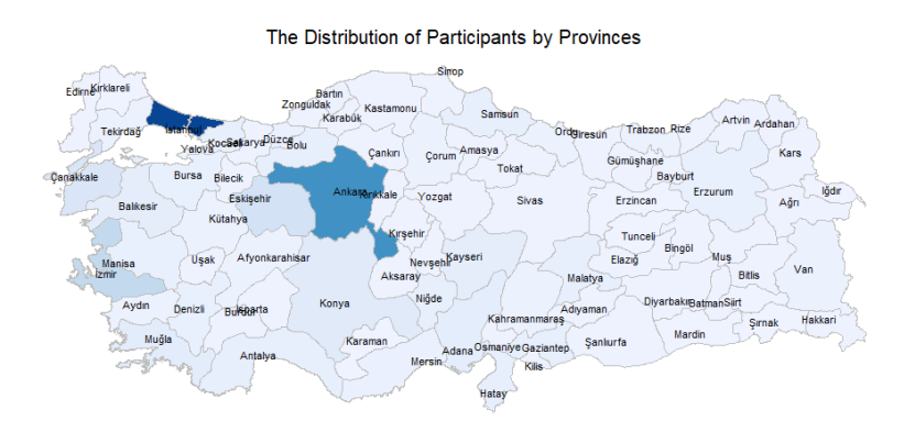
Figure 2: The Distribution of Participants by Provinces

Most of the participants were registered from İstanbul, Ankara, and İzmir, respectively. In the conference, we had participants from 73 provinces out of 81 provinces in Turkey. The distribution of registered participants by provinces is illustrated in Figure 2.